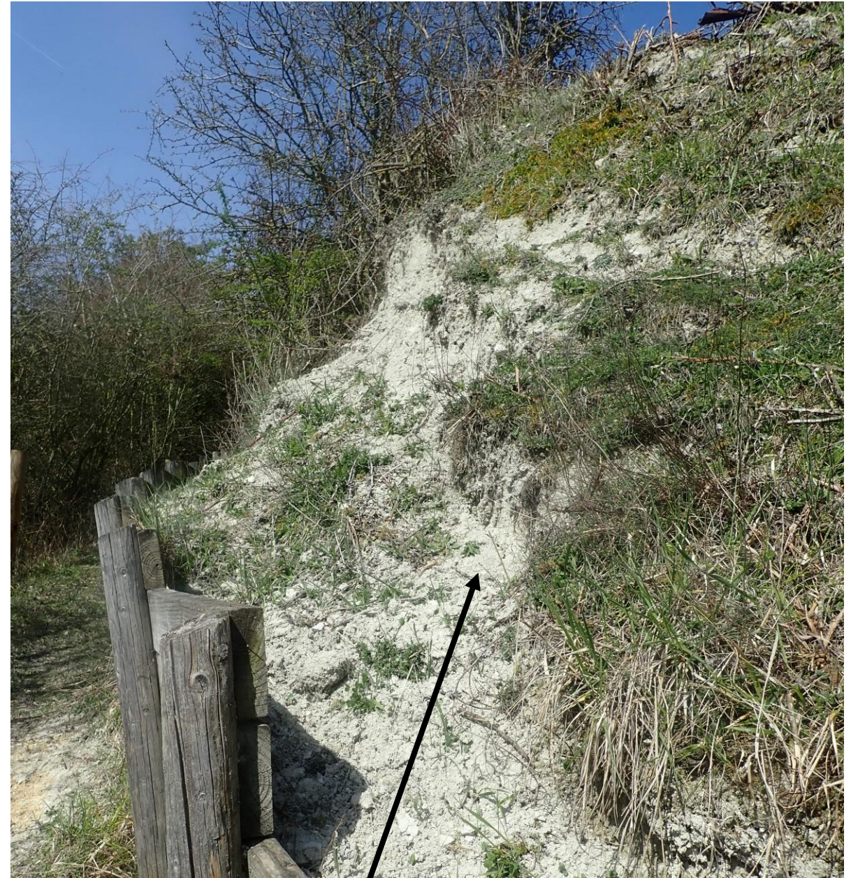
Location of cells